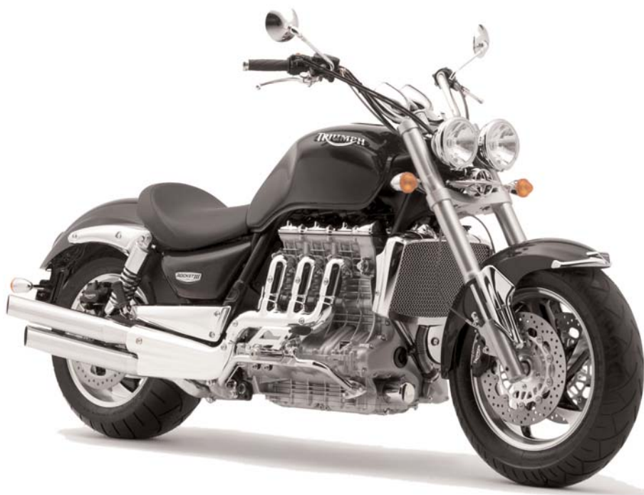
Triumph Rocket III motorcycle of 2,294 cc, a close-up of which is on the cover page; courtesy of Triumph Motorcycles Limited, all rights reserved.